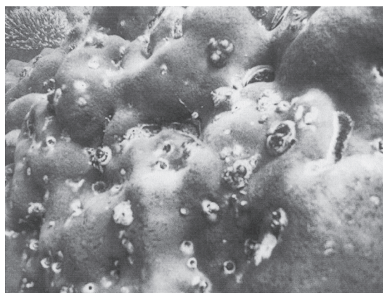
Fig. 3. Representative sample of high infestation of polychaetes on porite coral from 1m transect in North Bay

The polychaetes infecting the porites are Spirobranchus giganteus (Grube 1862), S. spinosus and Sabella sp. The polychaete infection leads to bleaching of corals in a small area which looks similar to infection by fungal diseases. The increased presence of polychaetes leaves the corals